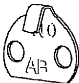
2-Hole lacing top