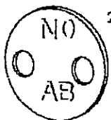
2-Hole lacing washer